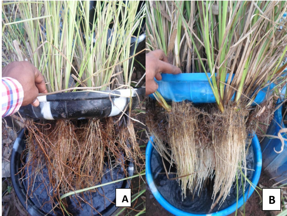
Plate 2. Showing treatment set-up in the screen house with C. zizanioides (A) and C. nigritana (B) under effluent from fertilizer company.